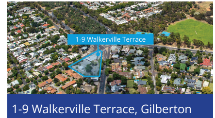
1-9 Walkerville Terrace, Gilberton

Size 6.75% Client HMC Capital Price $28,500,000