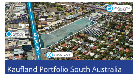
Kaufland Portfolio South Australia

Size 9,006m 2 Client Cancer Council Price $22,300,000