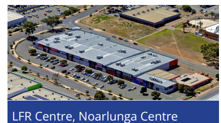
LFR Centre, Noarlunga Centre

Yield 4.25% Client Bunnings Price $48,800,000