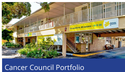
Cancer Council Portfolio

Size 39,933m 2 Client KPMG Price $44,000,000