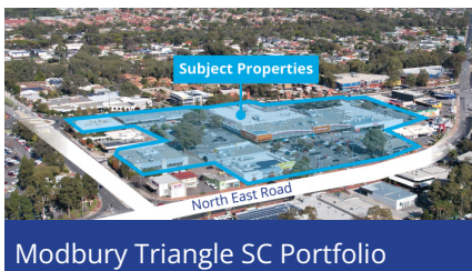
Modbury Triangle SC Portfolio

Size 6,219m 2 Client Matthews Hospitality Group Price $13,250,000