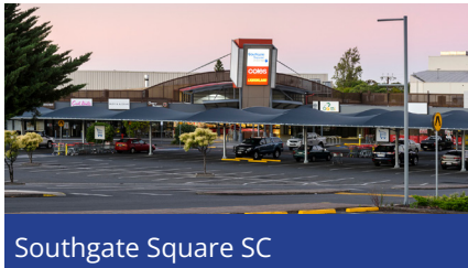
Southgate Square SC

What sets us apart is not what we do, but how we do it. We take pride in sourcing viable bids and executing transactions with tailored solutions to optimise premium outcomes.